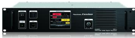
LC Echo 440 Repeater Yaesu DR-1X 442.925 MHz